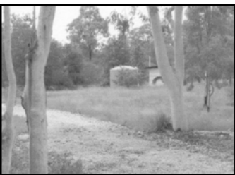
Our new tank, next to the Gallery toilets –part of the Waterwise Grant. No longer dam water for washing your hands!